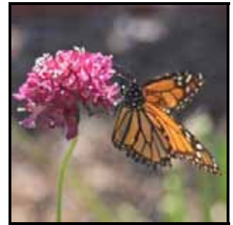
Monarch on pincushion

By the end of one hour, many hands had made light work, with time left to find garden critters like a young grasshopper, and three different butterfly caterpillars (Monarchs, Anise Swallowtails, and Cloudless Sulphurs) Kris was able to share with children.