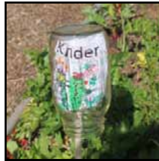
New Plant Markers