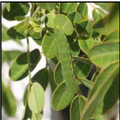
Can you find the Cloudless Sulphur caterpillar?

During this workday, children started veggies seeds in biodegradable seed pots made with a paper seed pot maker and recycled newsprint, both donated by Marblehead families.